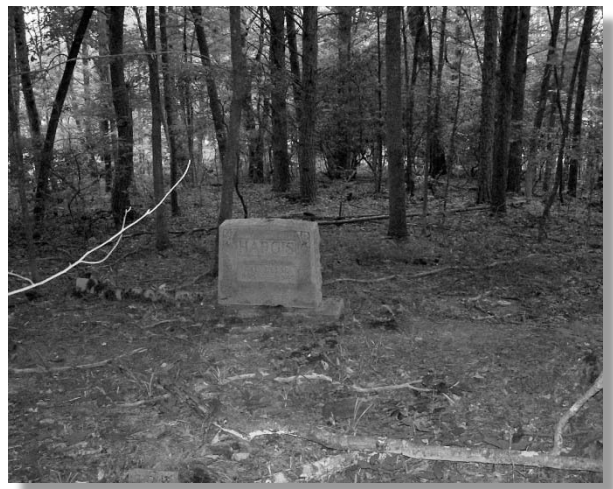
Cal Deese Hargis (1866–1943)

His plot is surrounded by a low, poured, concrete wall, sections of which have randomly fallen flat. I looked diligently for signs of another grave, but seeing that old Cal was seemingly buried in the center of the little plot, I assumed he was the master of an empty kingdom. The soil on either side had not given way to any sinking, a sure sign of interment, sometimes caused from a rotting burial casket or wooden box.