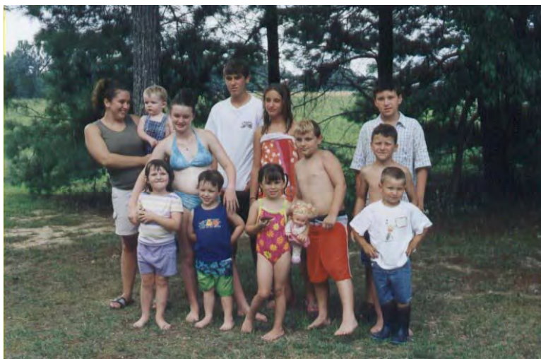
Cox Reunion, 2002 A Few of the Great-Great Grandchildren (and one Great-Great-Great)