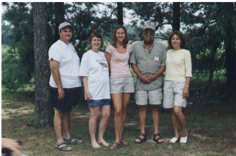
The Great Grandchildren's Spouses, 2002