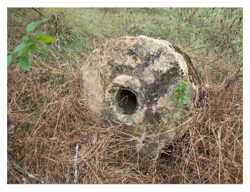
The broken casing of the old well surrounded by concrete—the well itself is still present but safely covered.