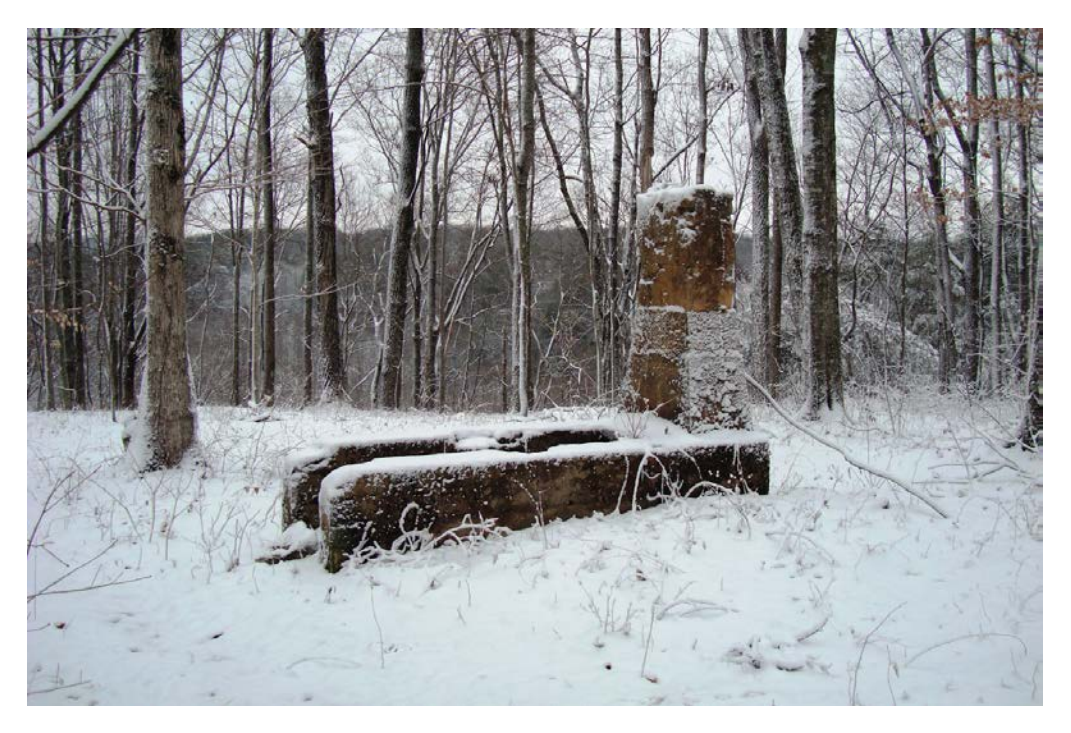
Above: the boiler setup showing how close to the bluff the operation was located.