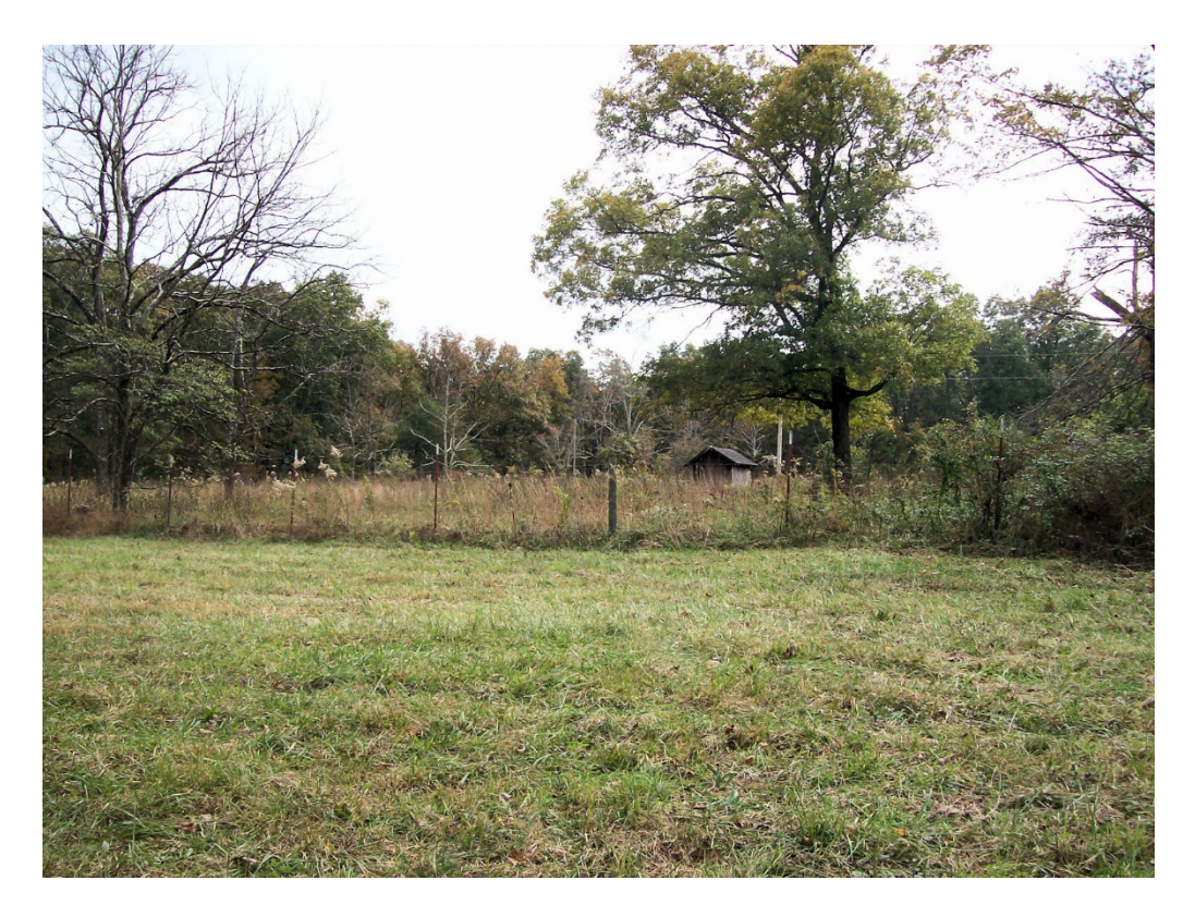
Location of the White Hotel (2014 Photo)