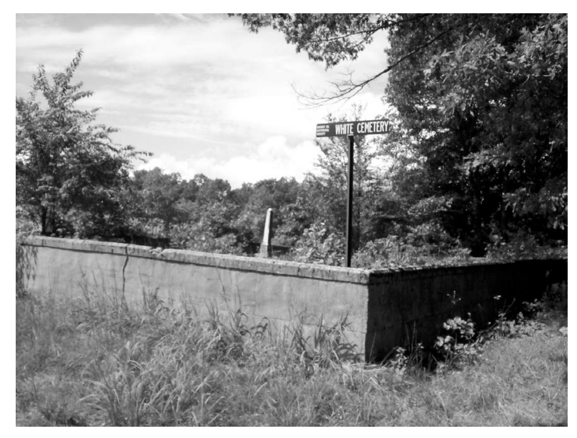
White Cemetery on Pigeon Springs Road in Grundy Co., TN

Following is a list of the stones and other available markings not in italics: