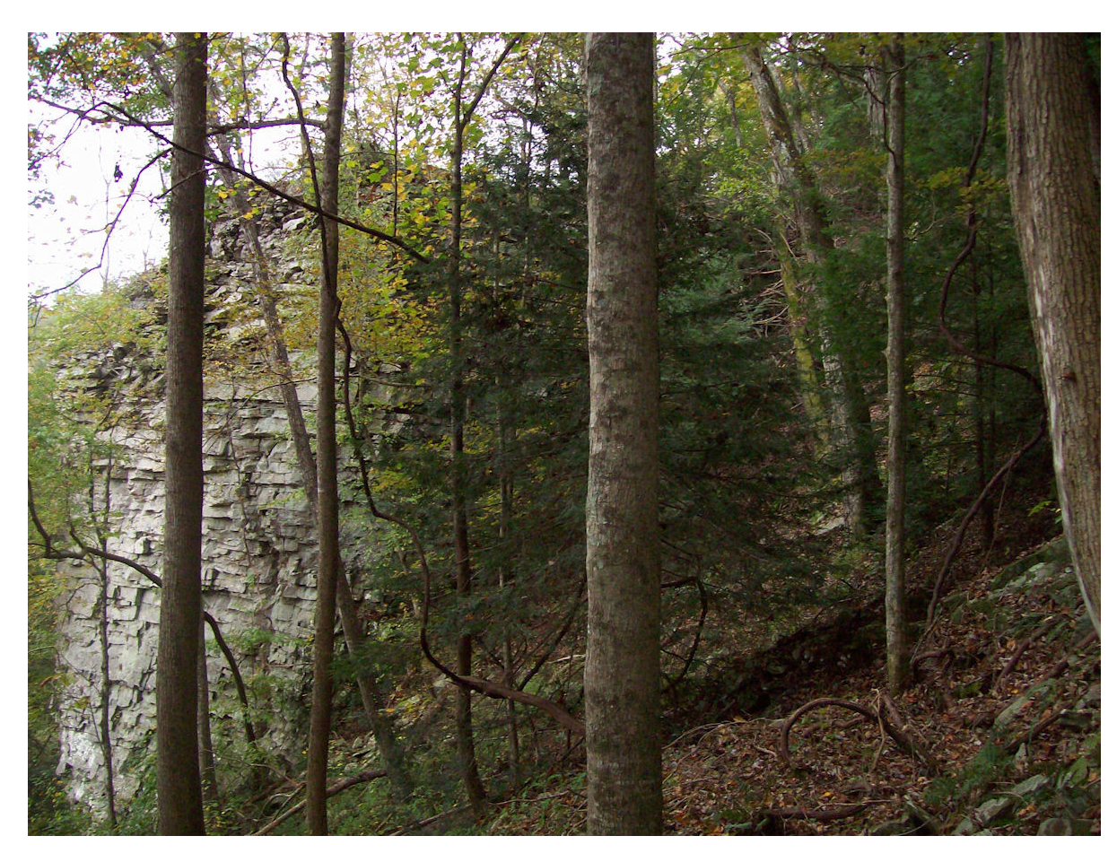
The bluff that shaded the pavilion for most of the day.

If you are looking for a good cool place to visit or to spend the summer why not come to Mineral Springs where you can find the best water and purest air that is to be found on top of Cumberland Mountain, with all the grand scenery right at the Hotel door. Address, W. S. White, Tracy City, Tenn."